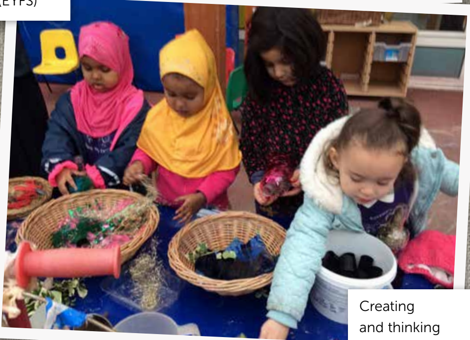
Creating and thinking critically. (EYFS)