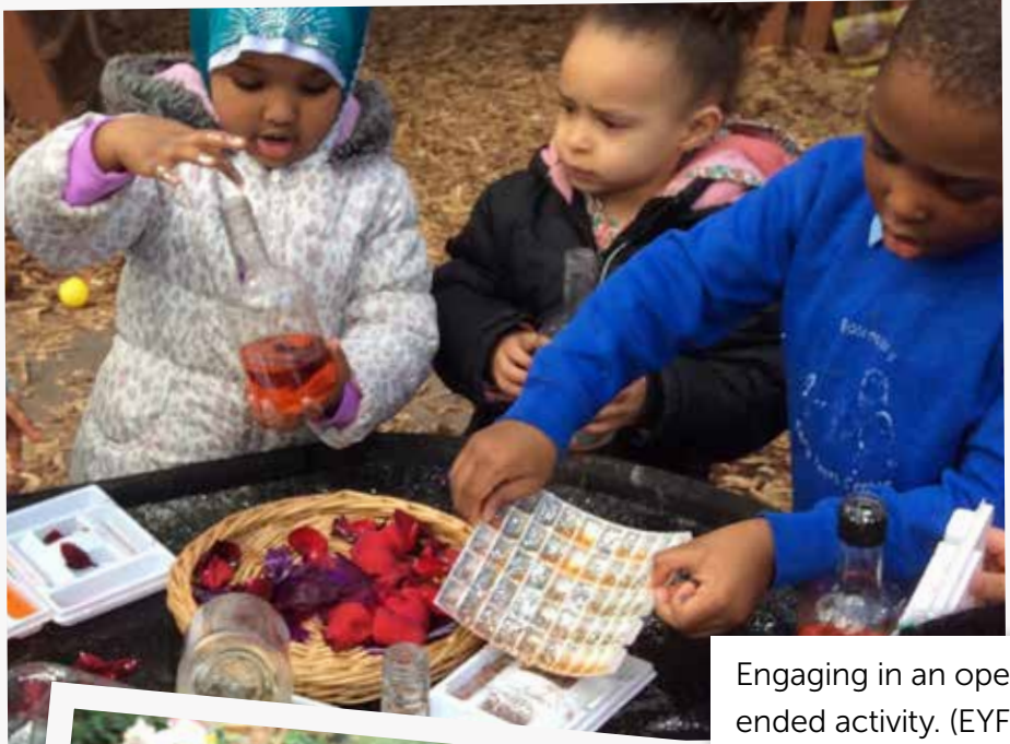
Engaging in an open ended activity. (EYFS)