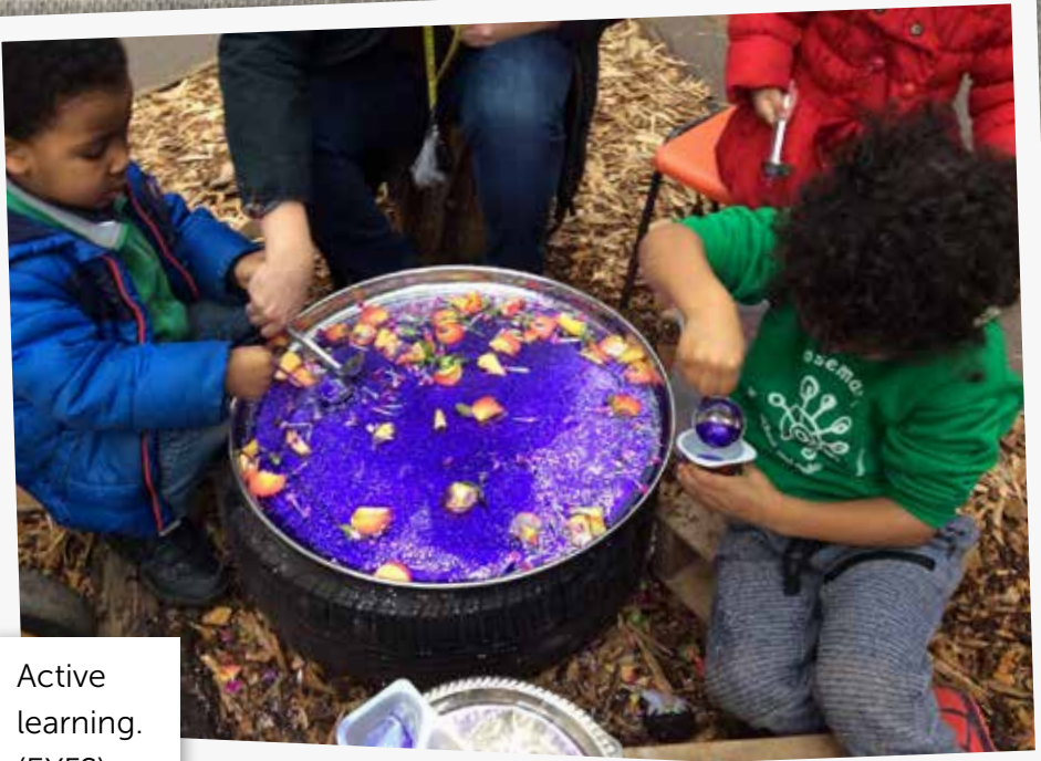
Active learning. (EYFS)