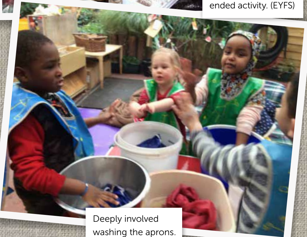
Deeply involved washing the aprons.